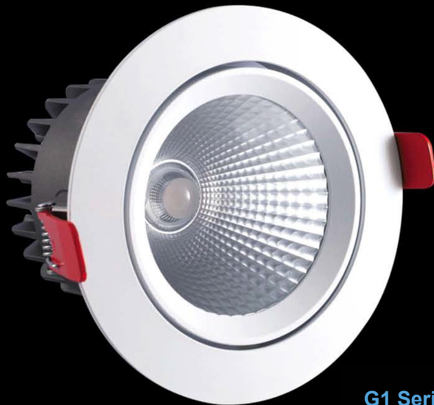
G1 Series Downlight